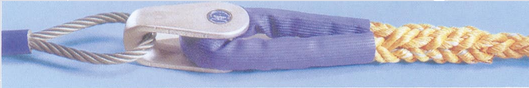
Fibre rope in the bolt, wire rope around the body.

Tønsberg Mooring Link - galvanised steel mooring link of compact design typically utilised as connection between wire rope and fibre forerunner. Available in three sizes 90 T, 120 T and 180 T. 300 T can be supplied on special request.